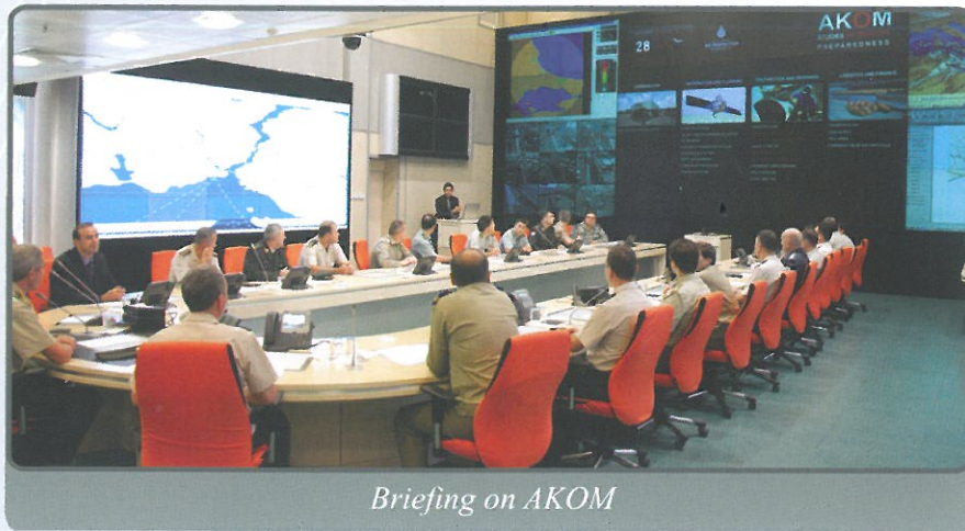
Briefing on AKOM

d) As a result, according to above mentioned NATO documents, PSO, HO and DRO are considered in the common concept of NA5CRO, and probably therefore, there is not a clear distinction between concepts. HO are used both as component of PSO and "Other NA5CRO". The remarkable difference between these two