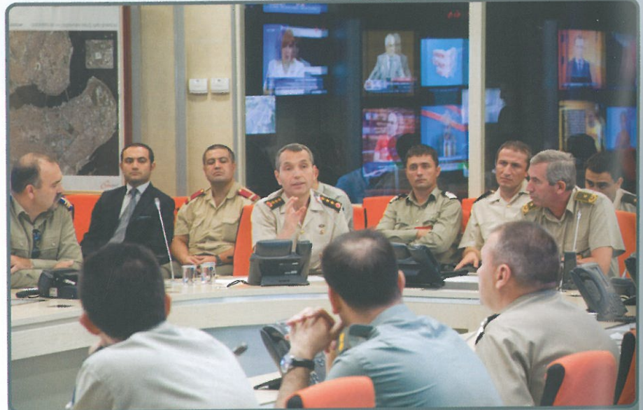
SEEBRIG's Visit to Disaster Coordination Center (AKOM) of Istanbul Metropolitan Municipality

1. If the definitions of PSO and HO terms in the Agreement (revised Art. I/1-n and I/1-g) are examined it will be perceived that these definitions do not give enough information to answer clearly above mentioned questions. Because they do not adequately clarify the fact that when